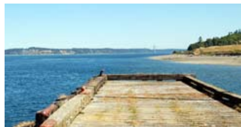
Looking north from North Dock

We are very excited to participate in this process. The valuable information that comes out of it will be used to create environmental education experiences to match the unbounded potential of the Chambers Creek Properties. As this process begins to unfold over the coming months, we expect to learn much about the Chambers Creek Properties and the large community it serves.