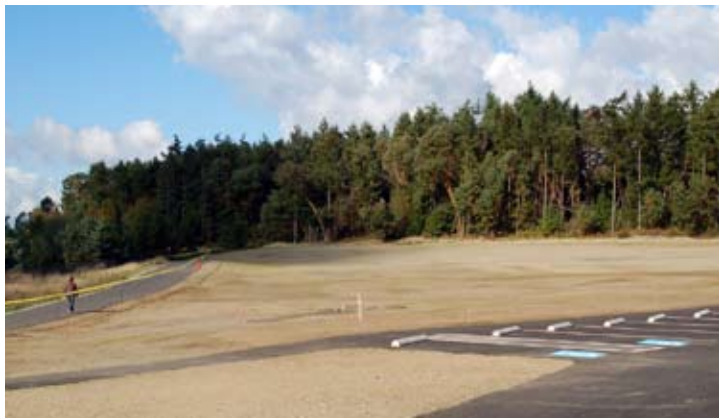
Looking northwest across North Meadow

The preservation of existing mining relics links the historic use of the site to the present. The “swing set” is a large concrete structure that is located at the west end of the event lawn. Remnants of seven sorting bins and a conveyor tunnel at the north end of the meadow serve as a buffer to the Chambers Bay golf course. Central Meadow also features a half-mile loop trail that links to Soundview Trail and will eventually provide access to the North Beach and North Dock via an overpass. Native grasses will be planted throughout in combination with hundreds of native shore pines and other trees. A new restroom facility at Central Meadow and a parking area with space for 84 cars will be opening early 2008. This will open vehicular access to the lower portions of the Soundview Trail, making it more accessible to all.