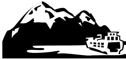
Serving our veterans in Pierce County