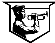
Calling veterans to the alert when warranted.