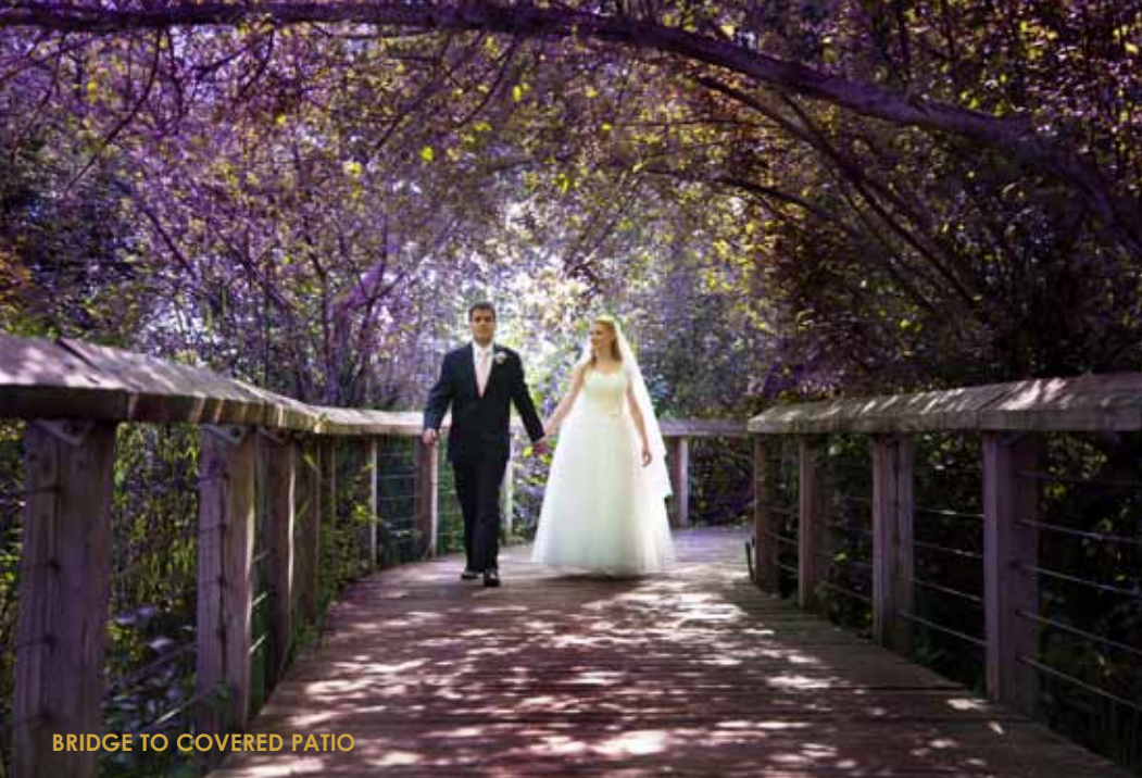
BRIDGE TO COVERED PATIO